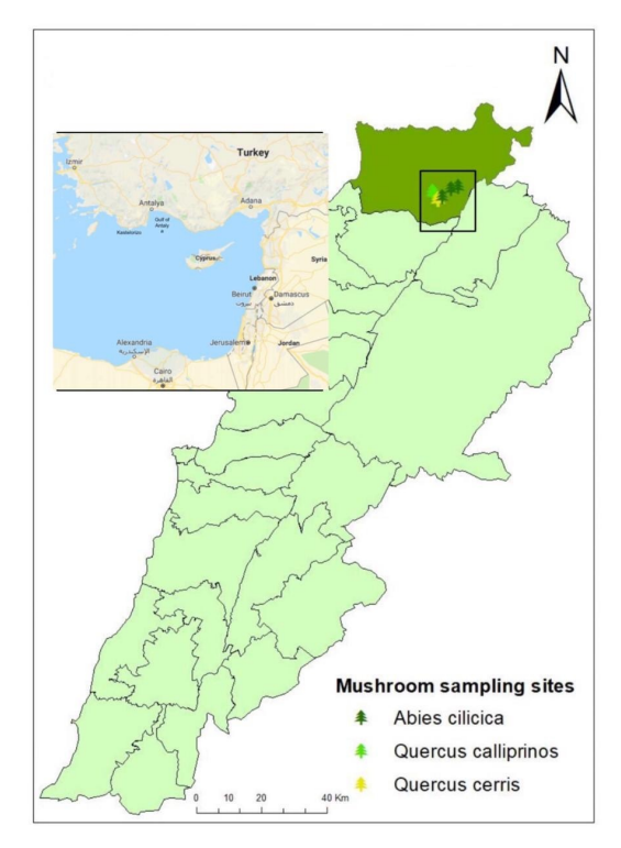
Figure 1: sampling sites location by ecosystem

This investigation aims at identifying fungal diversity within three forest ecosystems in Akkar in North Lebanon: Palestine oak ( Quercus calliprinos Webb.) forest, Turkish oak ( Quercus cerris L.) forest, and Cilician fir ( Abies cilicica (Antoine & Kotschy) Carrière) forest. Three public sites were chosen in Tesheh (T), Fnaydeq (F) and Qamouaa (Q) in the mountainous region of Akkar (Figure 1). All study sites were old-growth (more than 100 years old) pure stands dominated by each tree, with limited presence of other putative interacting plants, allowing to confidently assign both mycorrhizal and decaying fungal species to each tree species (Table 1 and 2). In each ecosystem, three plots, 50 m long ×10 m wide were defined and periodically surveyed. Field surveys were conducted every two weeks from early October to December 2018, until the sites were covered by snow. The long and persisting snow cover did not allow us to conduct further sampling in winter and early spring. Another field survey was performed in early May 2019, but no mushrooms were found.