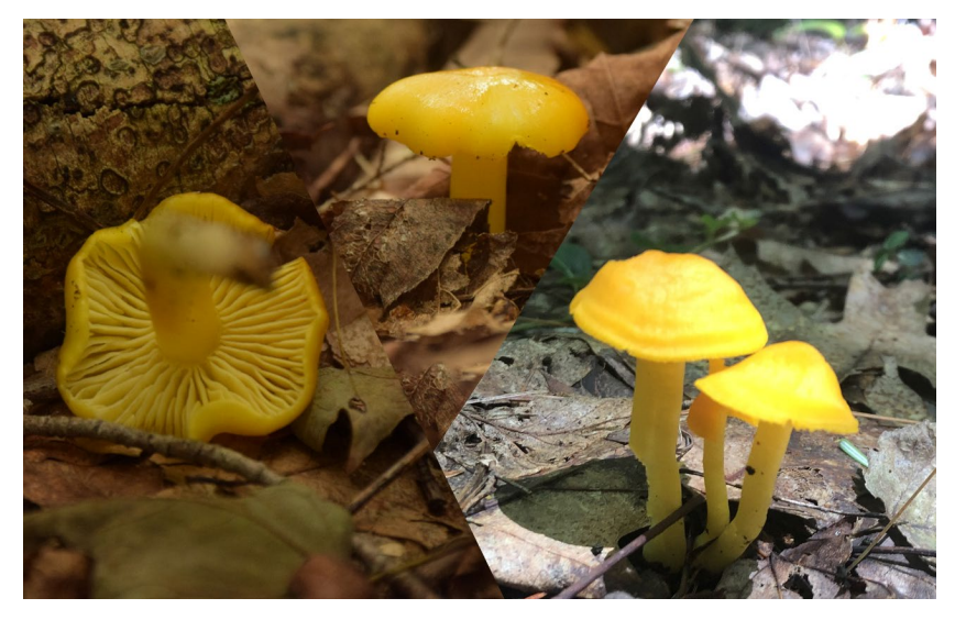
FIG 18. Hygrocybe flavescens (Kaufman) Siger (1951)

Hygrocybe flavescens (Kaufman) Siger (1951)