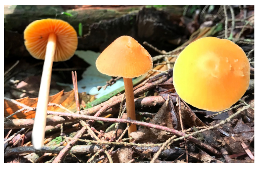
FIG 13. Entoloma salmoneum (Peck) Sacc. 1887

MYCOBANK 195880 COLLECTION: TC - Tsuga Creek #11.13.01.2021