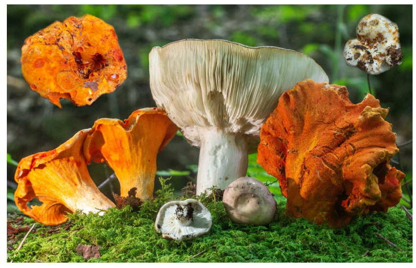
FIG 23. Hypomyces lactifluorum (Schwein.) Tul. & C. Tul (1860)