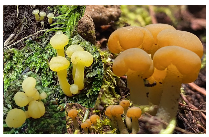
Fig 27. Leotia lubrica (Scop.) Pers. (1797)

MYCOBANK 168198 COLLECTION: TC - Tsuga Creek #21.28.01.2021