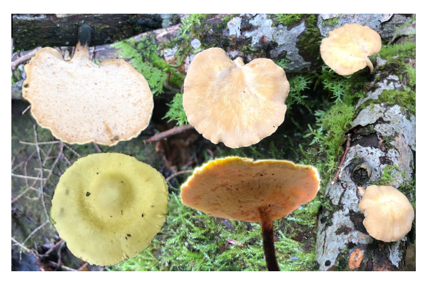
FIG 11. Cerioporus leptocephalus (Bull.) Courtec. (1994)

Cerioporus leptocephalus (Bull.) Courtec. (1994)