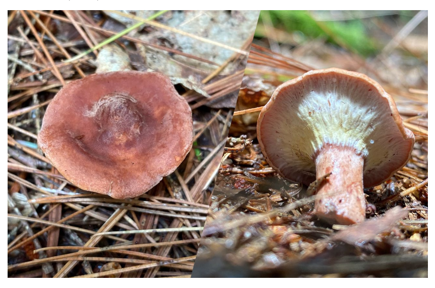
FIG 20. Hypomyces camphorati Peck (1906)