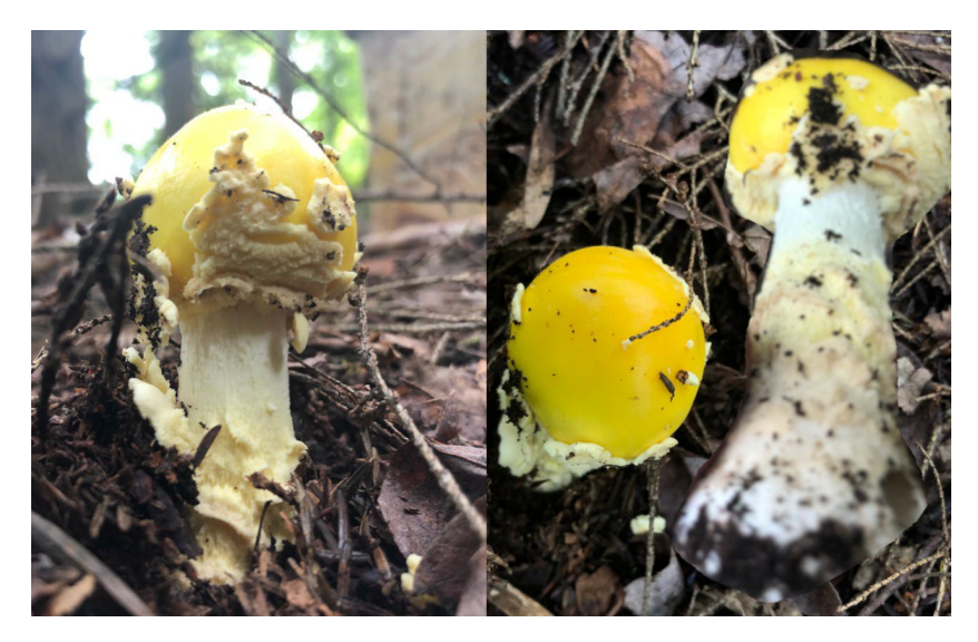
FIG 3. Amanita muscaria var. guessowii Veselý (1933)