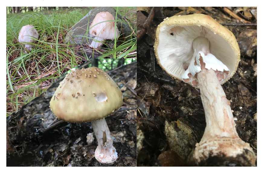
FIG 4. Amanita rubescens var. alba Coker (1917)