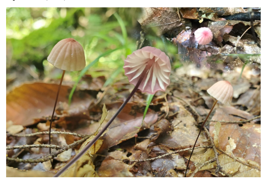
FIG 30. Marasmius pulcherripes Peck (1872)