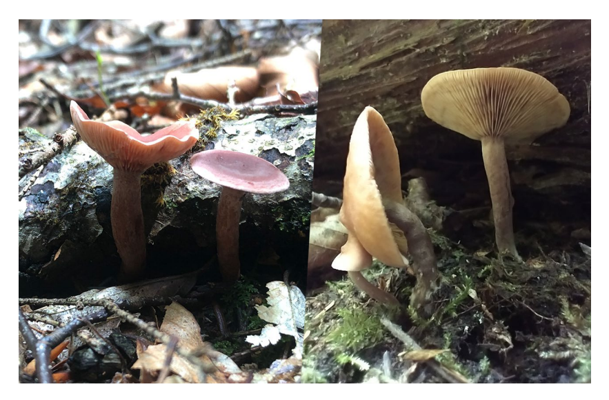
FIG 26. Lactarius camphoratus (Bull.) Fr. (1838)