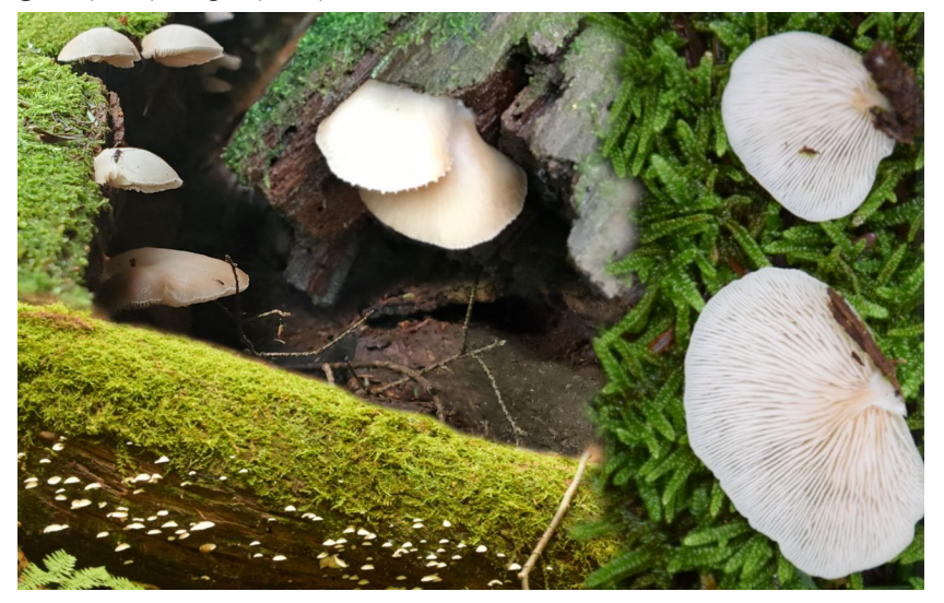
FIG 33. Pleurocybella porrigens (Pers.) Singer (1947)

Pleurocybella porrigens (Pers.) Singer (1947)