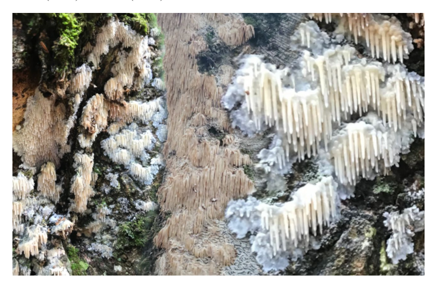
FIG 35 Radulomyces copelandii (Bull.) P. Karst (1879)

Radulomyces copelandii (Bull.) P. Karst (1879)