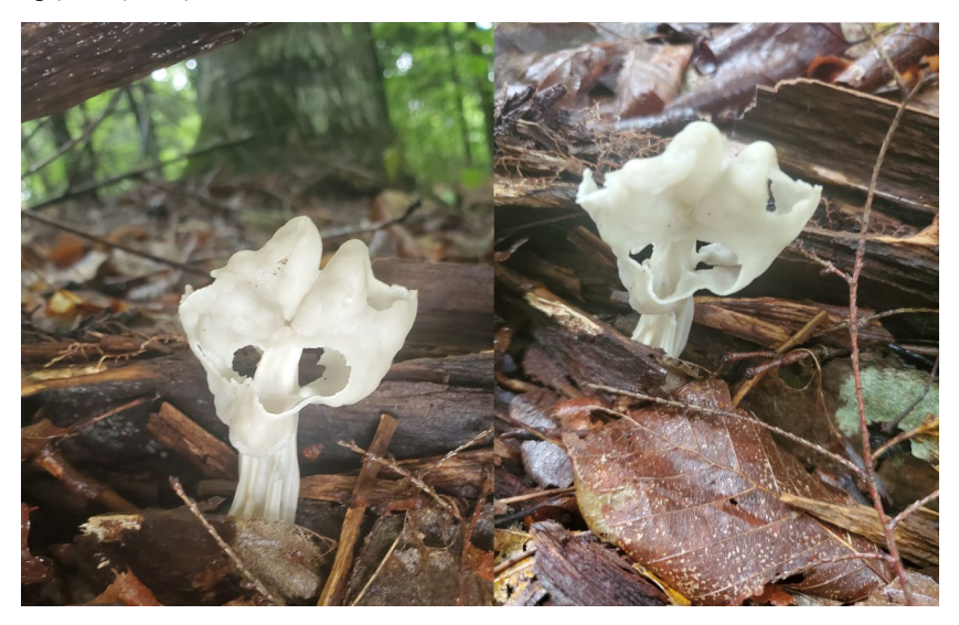
FIG 17. Helvella crispa (Scop.) Fr. (1882)