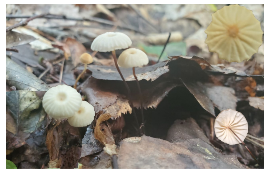
FIG 29. Marasmius capillaris Morgan (1898)