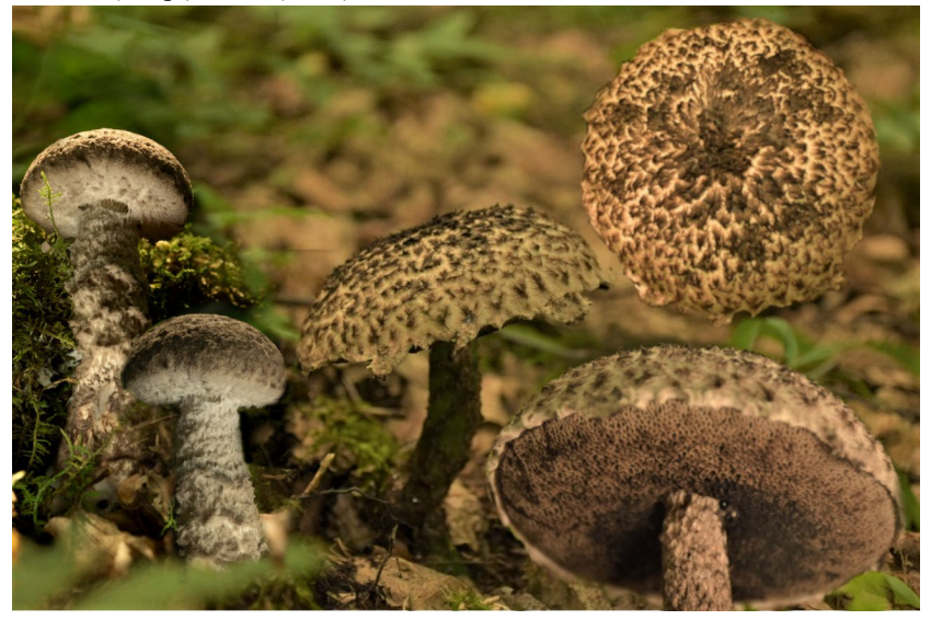
FIG 37. Strobilomyces strobilaceus (Scop.) Berk. (1851)