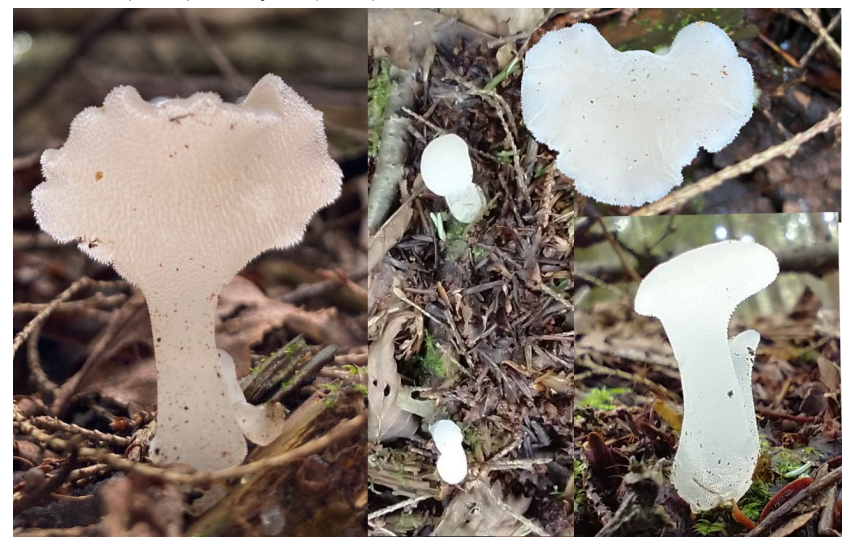
FIG 34. Pseudohydnum gelatinosum (Bres.) Kobayasi (1954)

Pseudohydnum gelatinosum (Bres.) Kobayasi (1954)