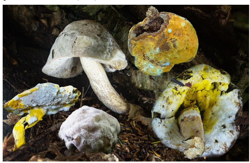
FIG 21. Hypomyces chrysospermus Tul. & C. Tul (1860)

MYCOBANK 204359 COLLECTION: TC - Tsuga Creek, BR - Betula Ridge #20.23.02.2021 ECOLOGY: Parasitic on Boletaceae . Found under Tsuga, Acer , and Betula .