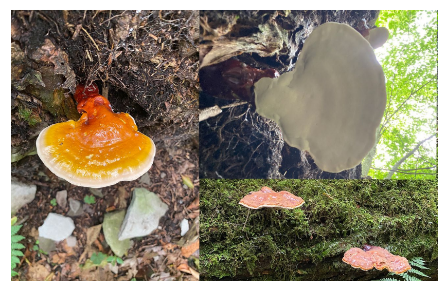
FIG 15. Ganoderma tsugae (Murrill) (1902)