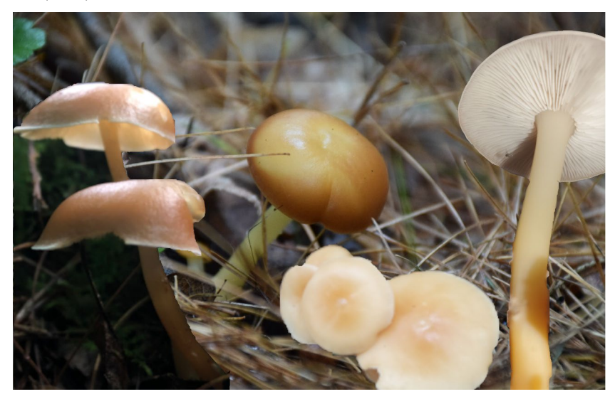
FIG 16. Gymnopus dryophilus (Bull.) Murrill 1916