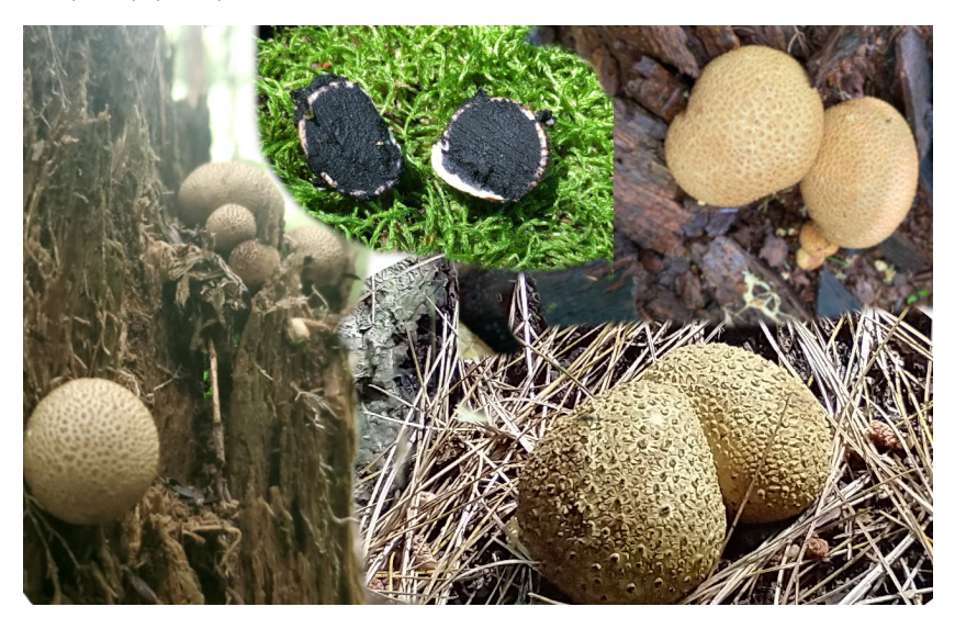
FIG 36. Scleroderma citrinum (Pers.) (1801)