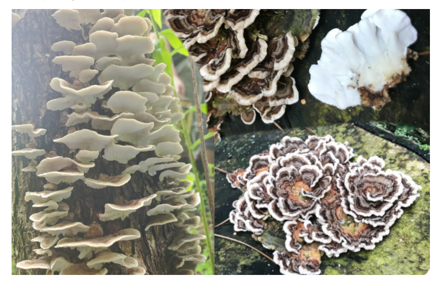
FIG 40. Trametes versicolor (L.) Lloyd (1920)