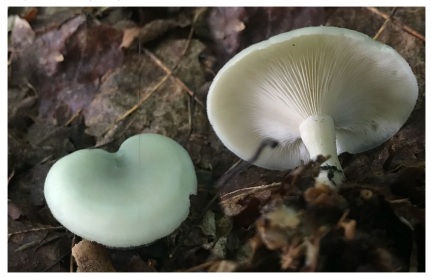
FIG 12. Clitocybe odora (Bull.) P. Kumm (1871)