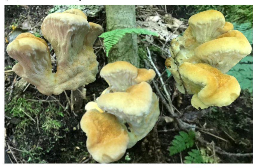
FIG 8. Bondarzewia berkeleyi (Fr.) Bondartsev & Singer (1941)

Bondarzewia berkeleyi (Fr.) Bondartsev & Singer 1941