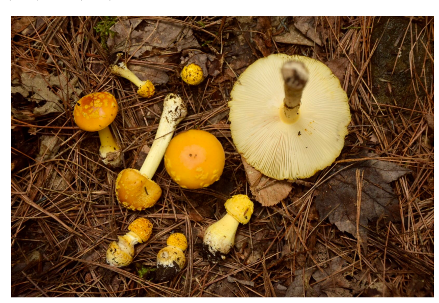
FIG 2. Amanita frostiana (Peck) Sacc. (1877)