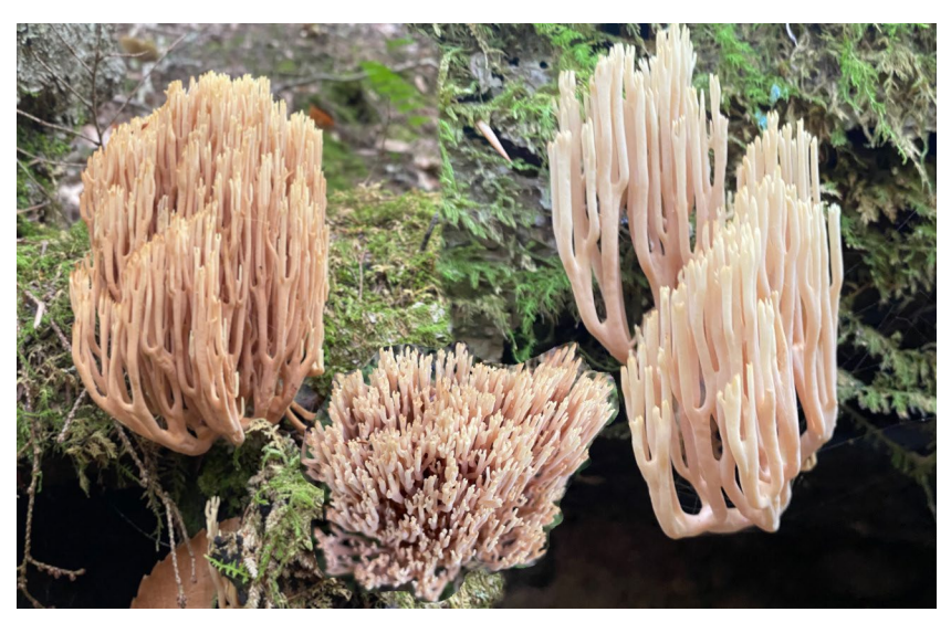
FIG 5. Artomyces pyxidatus (Pers.) Jülich (1982)