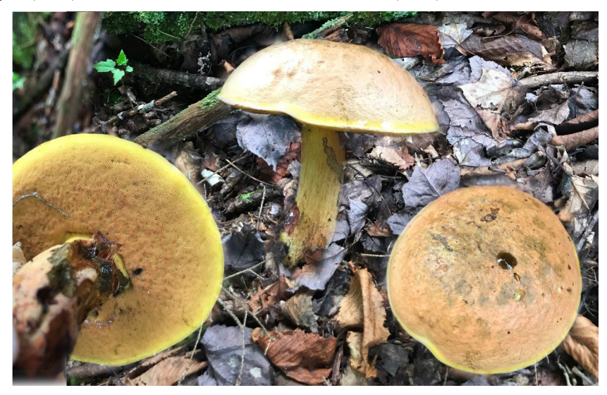
FIG 6. Boletus subvelutipes (Peck) Bulletin of the New York State Museum (1827)

Boletus subvelutipes (Peck) Bulletin of the New York State Museum (1827)