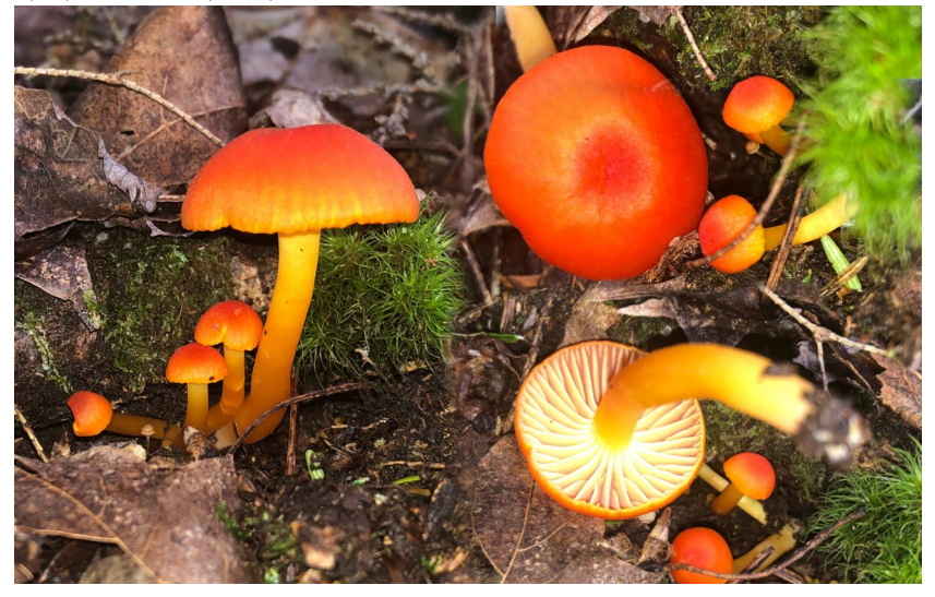
FIG 19. Hygrocybe miniata (Fr.) P. Kumm (1871)