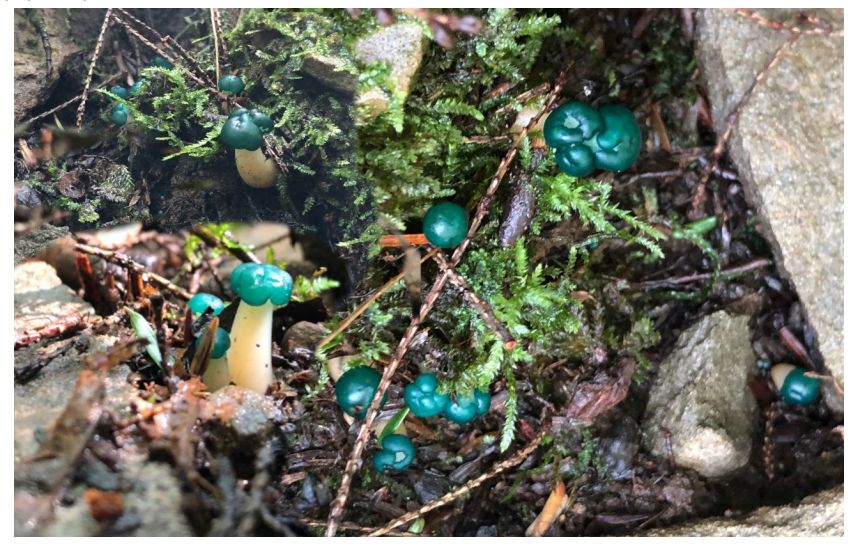
Fig 28. Leotia viscosa (Fr.) (1822)