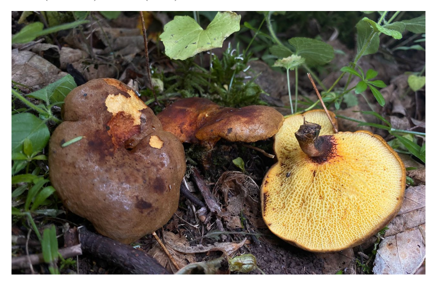
FIG 7. Boletinellus merulioides (Schwein.) Murrill (1909)

Boletinellus merulioides (Schwein) Murrill (1909)