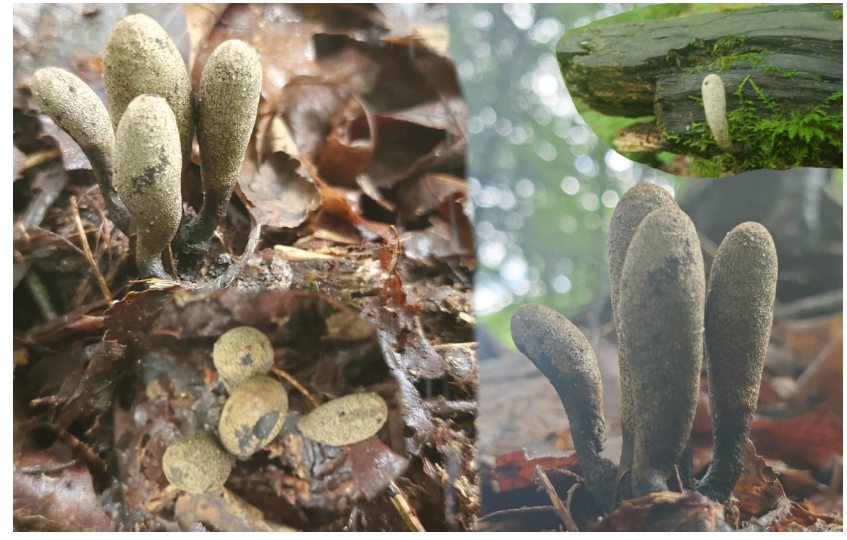
FIG 42. Xylaria polymorpha (Pers.) Grev. (1824)