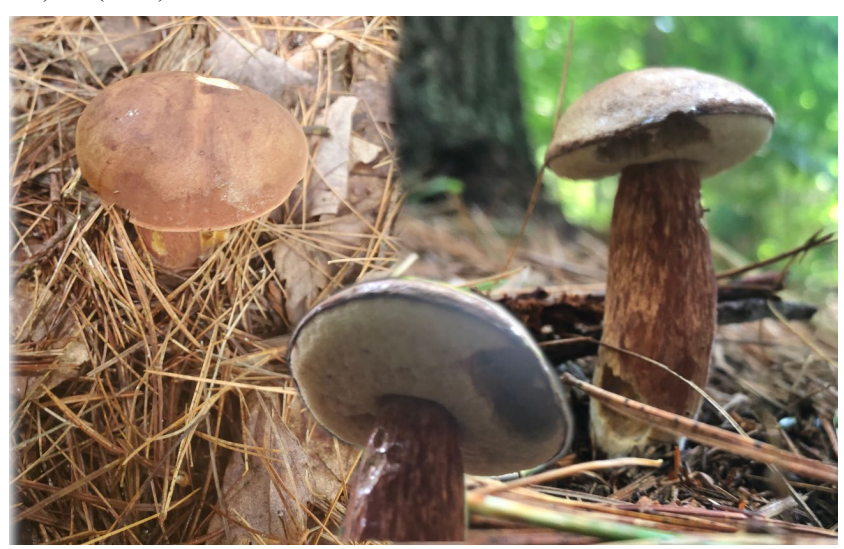
FIG 25. Imleria badia (Vizzini) Fr. (2014)