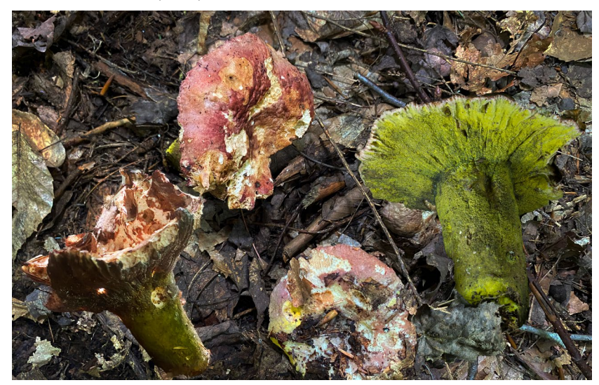
FIG 24. Hypomyces luteovirens Tul. & C. Tul (1860)

Hypomyces luteovirens Tul. & C. Tul (1860)