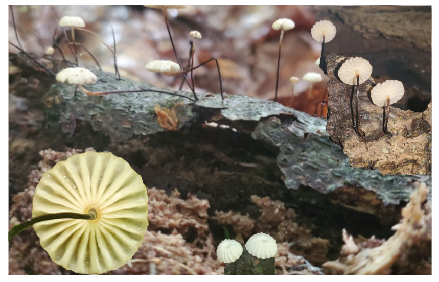
FIG 31. Marasmius rotula (Scop.) fr., (1838)